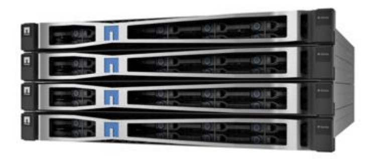
Figure 1: Typical SolidFire Cluster

NetApp Element Software 12.2 is an Operating System (OS) for nodes within a SolidFire Storage System – a scale-out, all-flash, highly-available clustered storage system. A cluster (see Figure 1) is made up of a collection of nodes that provide data storage and management. Each cluster of the storage system is scalable from 4-40 independent nodes providing 80 TB to over 3 PB of capacity.